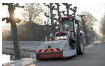
XPU URBAN APPLICATIONS