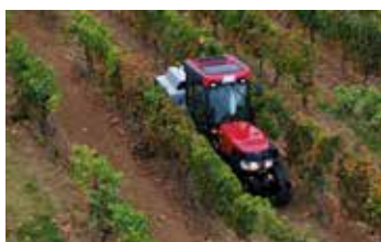
XPS VITICULTURE ORCHARDS