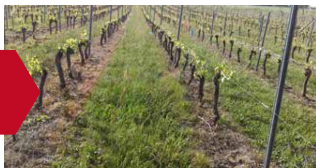
AFTER 15 DAYS