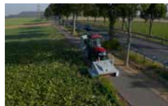
XPU URBAN APPLICATIONS