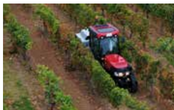
XPS VITICULTURE ORCHARDS