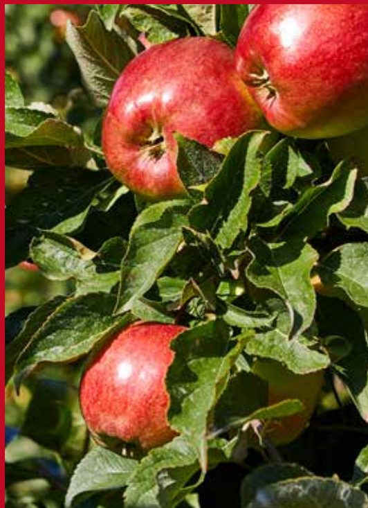
For fruit growers