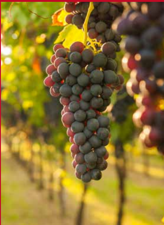
For wine growers